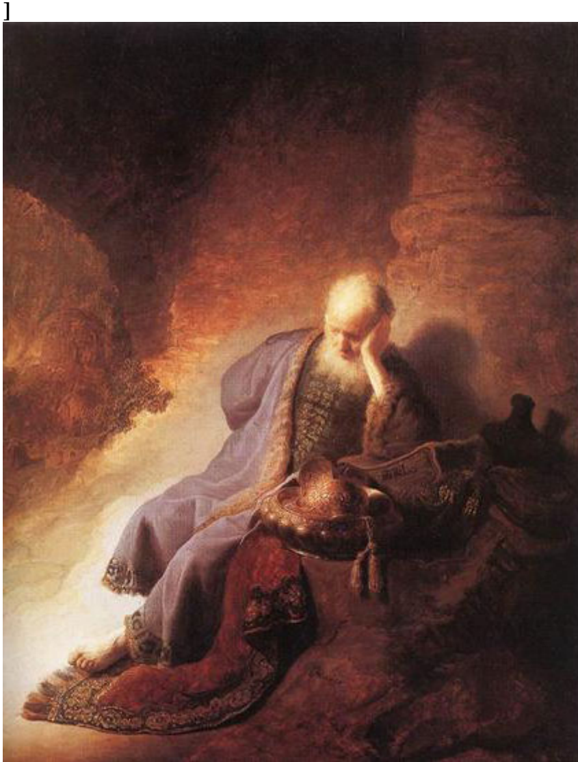
Jeremiah Lamenting the Destruction of Jerusalem

[INSERT IMAGE OF THIS PAINTING HERE—Again, what format should I use to submit image?