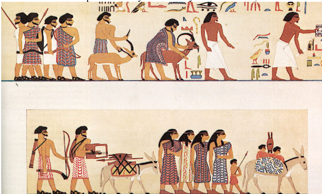
Drawing from throne room of Ashurnasirpal II

In 879 BCE, King Ashurnasirpal II of Assyria built a magnificent palace that was still in use over a century later in Yeshayahu's time. Like all other nations in Assyria's power grip, Israel and Judah had to send emissaries to the Assyrian palace with protection money if they wanted to avoid being conquered. Such an emissary would have been impressed by the many scenes of Assyrian battle victories etched in the palace hallways. In the Assyrian throneroom, he would see this relief: