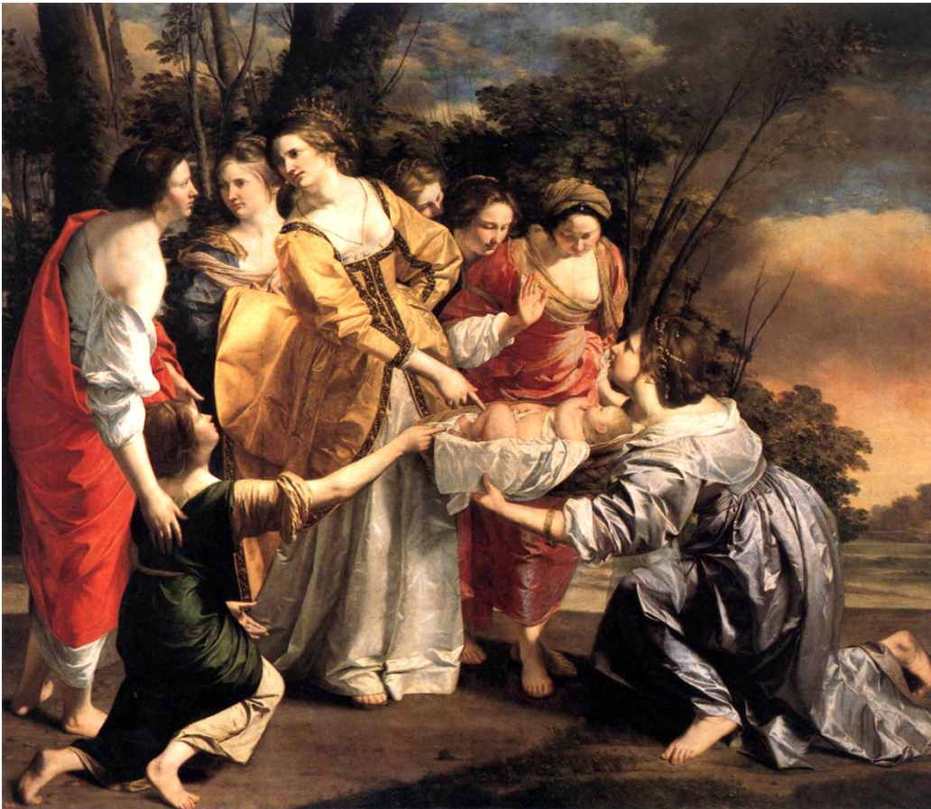
The Finding of Moses by Orazio Gentileschi (1633)

For example, Shemot 2:5 narrates: “The daughter of Pharaoh came down to bathe in the Nile, while her maidens walked along the Nile. She spied the basket among the reeds and sent her slave girl to fetch it.” The question arises, what role do the maidens play in this story? A wonderful trigger for this discussion is The Finding of Moses by Orazio Gentileschi (1633). This painting depicts tension between the princess and her maidservants. While the princess and one of the maidservants point to the circumcision as evidence for the need to murder the baby, the maidservants on the other side show caring and seem to plead for compassion.